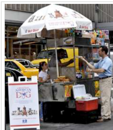
353 Views - Click for Larger Image

Just when you thought TV producers were running out of ideas for reality shows, they unleash a show starring dogs!